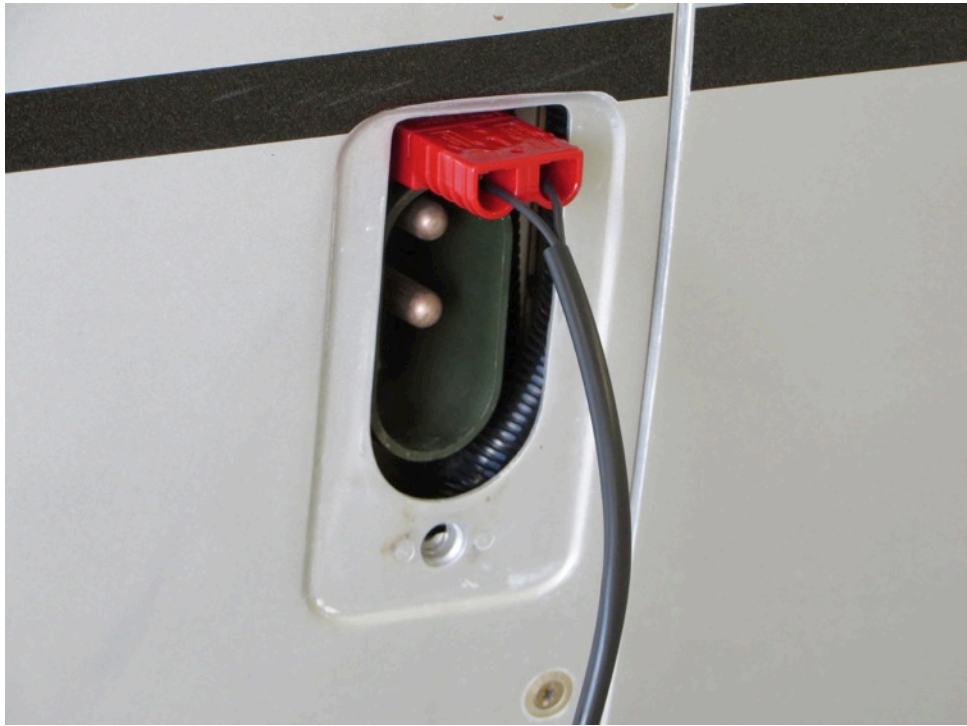
Finished installation with mating charger cable connected.