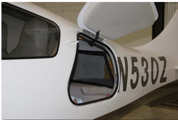
Columbia 400 aft baggage door.