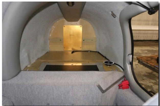
Aft baggage interior with trim removed.