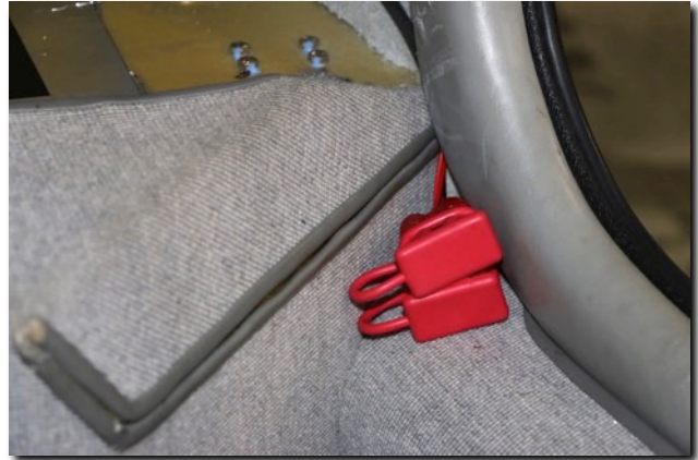
SB50 charger plugs with protective covers.