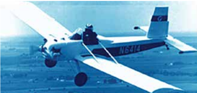
VP-1 Plans and Handbook.....P/N 13-11560