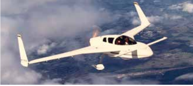
Cozy Mark IV Plans.....P/N 01-00178