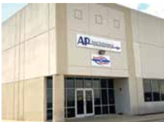
AIRCRAFT SPRUCE SOUTH FORT WORTH, TEXAS