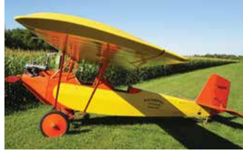
Original Pietenpol Air Camper Plans.....P/N 01-01307