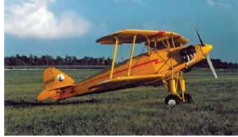
Skyote Plans Kit .....P/N 01-01512