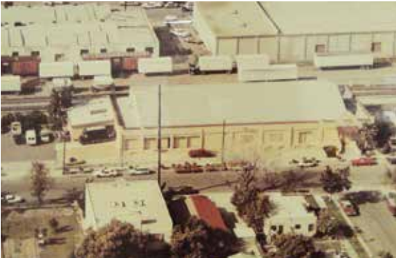
201 West Truslow Ave, Fullerton CA. Home of Aircraft Spruce from 1973 to 1997