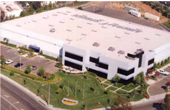
Present Home of Aircraft Spruce West (225 Airport Circle, Corona, CA.)