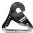
CLIP TYPE END FITTING P/N 442868 (Steel) --- Ea.