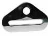
TRIANGULAR END FITTING P/N 13-04101 --- Ea.