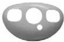
PA 12 & 14