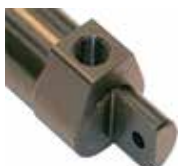
Right Offset Tab 3/16" hole drilled 90° to fitting