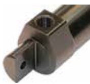
Left Offset Tab 3/16" hole drilled 90° to fitting