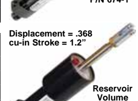
Reservoir Volume 2.0 cu-in P/N 675-1