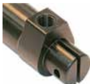
Slotted -0.090" slot inline with fitting. 3/16" hole drilled 90° to fitting.