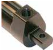
Inline -3/16" hole drilled inline with fitting Tab is offset 90° to fitting