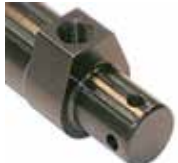
Cross Drilled - 3/16" holes inline with fitting and also 90° to fitting