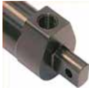
90° Offset - 3/16" hole drilled 90° to fitting. Tab is inline with fitting.