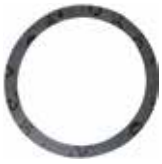
TCM MAGNETO GASKET 649954 P/N 05-11920