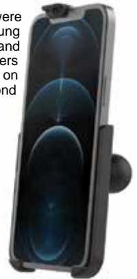
RAM® Form-Fit Cradle for Apple iPhone 12 & 13 Pro Max with Ball P/N 11-19216

These high-strength composite, form-fit cradles were designed specifically for the Apple and Samsung devices. Allowing for one-handed docking and removal, all buttons, cameras, ports, and speakers are left exposed. With the two-hole AMPS pattern on the back of each cradle, attach to a RAM® diamond ball base and additional RAM® components.