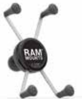
RAM® X-Grip® Large Phone Holder with Ball P/N 11-12987