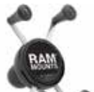
RAM® X-Grip® Universal Phone Holder with Ball P/N 11-09777

Compatible and interchangeable with a wide range of popular RAM® mounting products